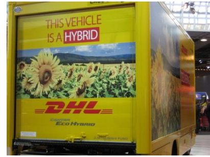
Amersfoort, The Netherlands

The WHITING C4 roll-up door includes the following value added features: