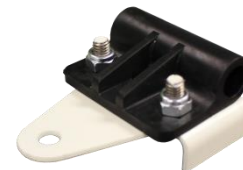
Composite Roller Bracket w/Powder Coated Stainless Steel Base

The C4 door model is now in production in Burlington, Ontario. Due to licensing agreements this product is available in North America exclusively to Canadian truck and trailer body manufacturers.